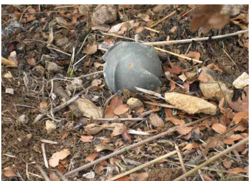
An unexploded, air-dropped BLU-63 submunition blends in to a field just outside Beit Yahoun, Lebanon, on October 24, 2006. Such US-made submunitions, used by Israel in 2006, date back to the Vietnam War.