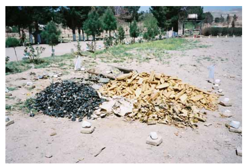
Deminers created these piles of debris as they cleared hundreds of submunitions from a site near Herat, Afghanistan. The block objects are BLU-97 caps, or "spiders." Also visible (clockwise from upper left) are: pieces of cluster munition casings, the yellow foam that surrounds the submunitions, empty submunition canisters, and parachutes.