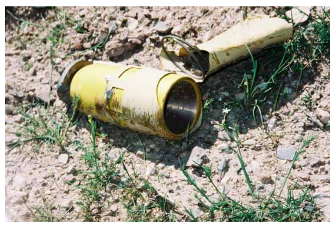
Two BLU-97 submunitions lie in a field near Herat, Afghanistan. The left one is unexploded. Its shaped charge, an anti-armor concave cone, is visible at its right end, and the exterior canister has slipped to expose its antipersonnel fragmentary core.