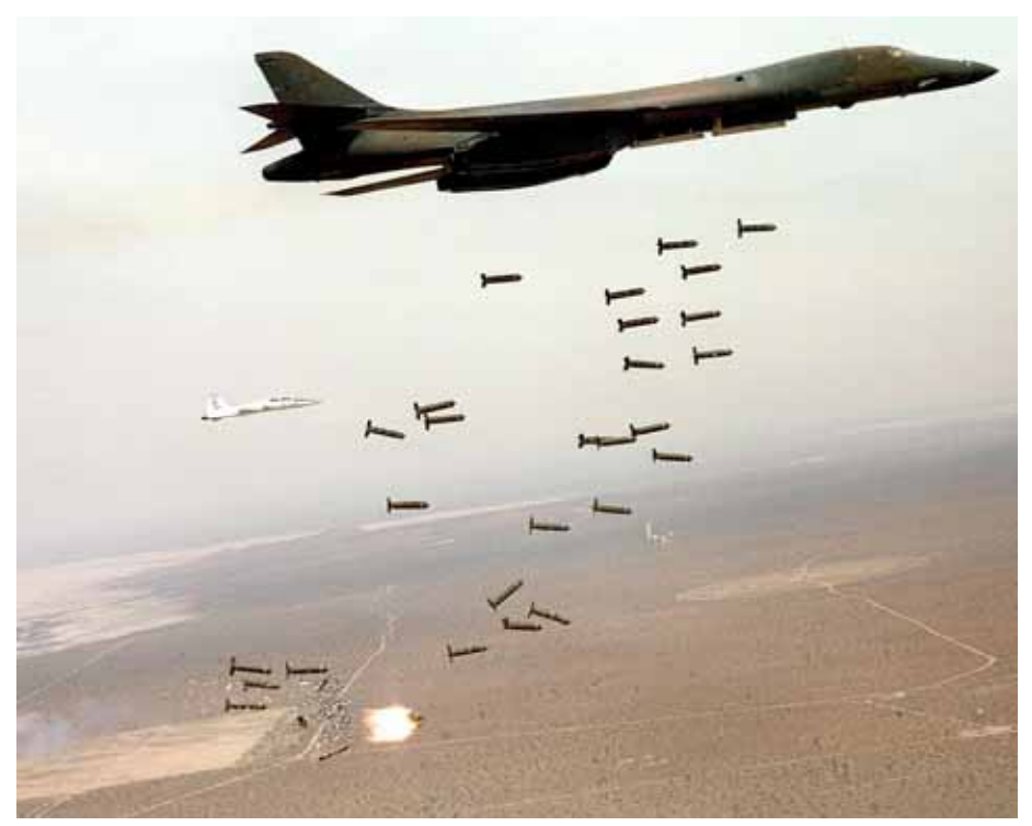
A US Air Force bomber drops cluster munitions during a training exercise.