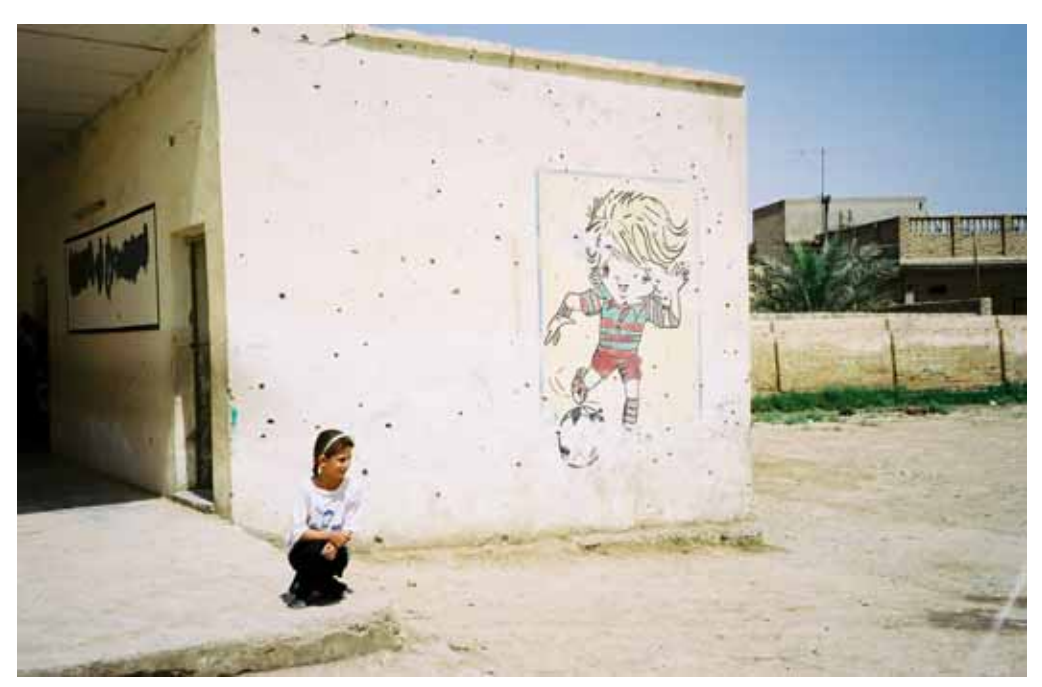
A girl sits in the playground of the pockmarked al-Hadaf primary school in al-Hilla, Iraq. Air-dropped US submunitions killed two civilians and injured 13 when they hit the school on April 24, 2003.