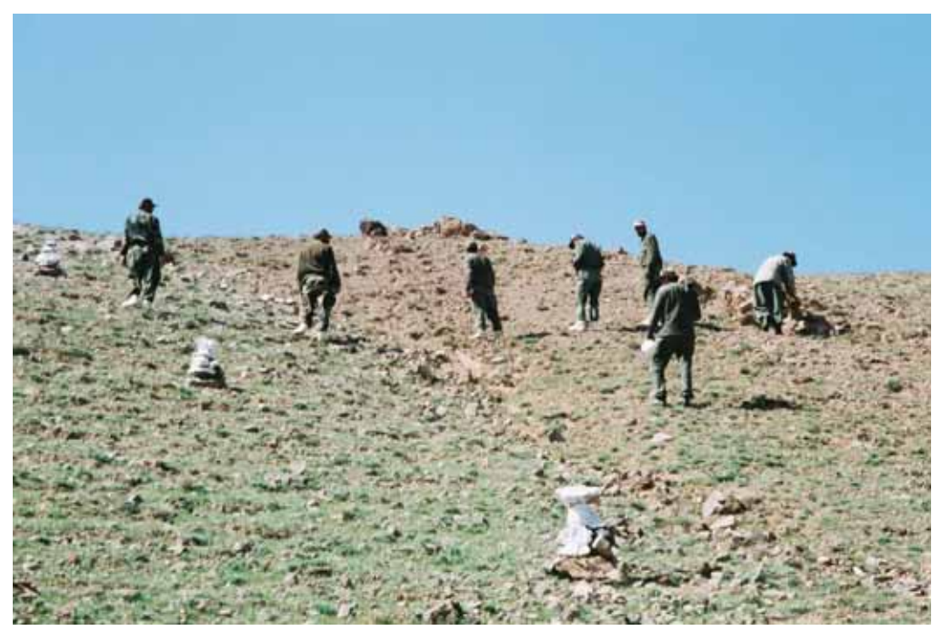
Deminers from the Afghan Organization for Mine Awareness and Afghan Rehabilitation (OMAR) look for unexploded submunitions on the surface of this hill outside Herat, Afghanistan, in March 2002. OMAR did not have enough equipment to give every deminer a metal detector.