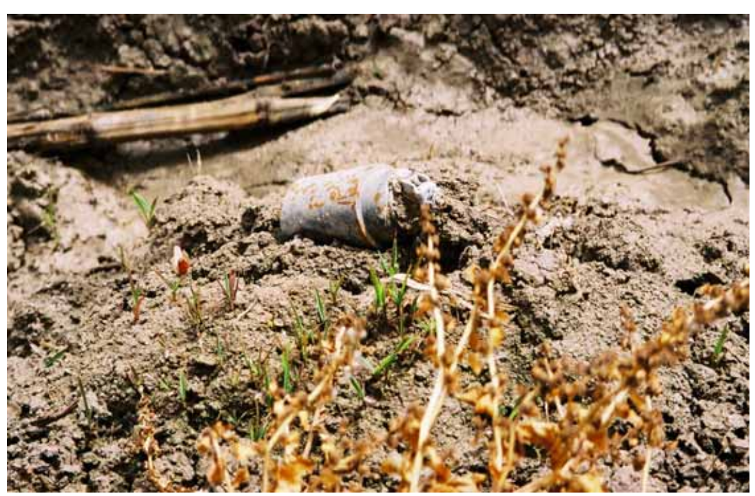
An unexploded US Dual Purpose Improved Conventional Munition (DPICM), a type of ground-launched submunition, rests in the mud of a farmer's field outside of Agargouf, Iraq, in May 2003.