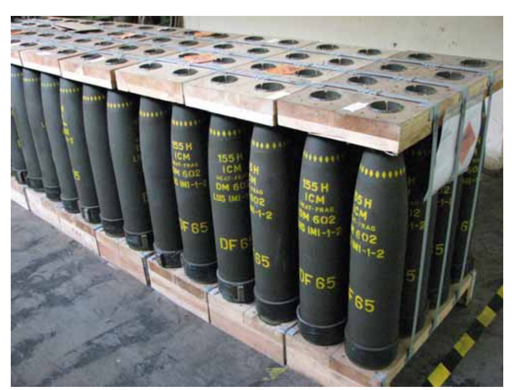
DM-602 155mm cluster munition artillery projectiles are stockpiled at a facility in Germany. The projectiles were made in Israel.