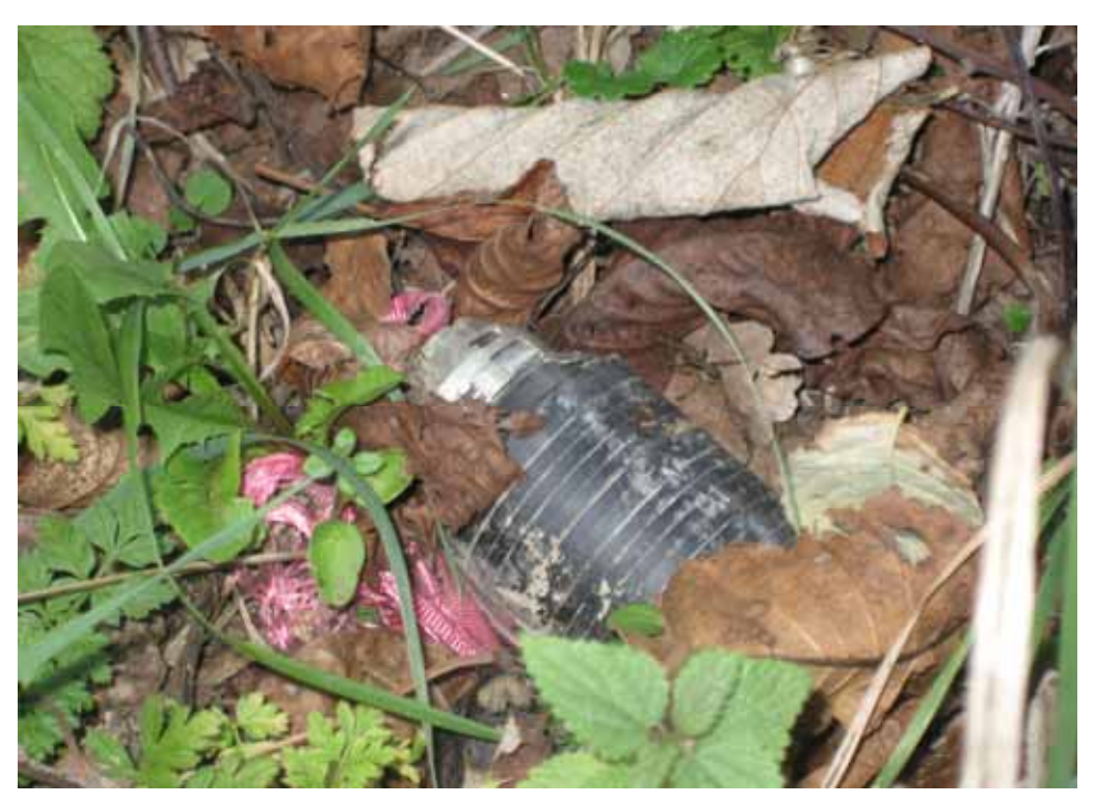
An unexploded M85, an antipersonnel and anti-armor submunition, rests hidden under leaves in a farmer's field in Shindisi, Georgia, in October 2008. This submunition was bought from Israel and launched by Georgia.