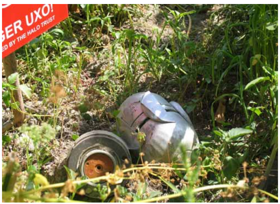
An unexploded Russian AO-2.5 RTM submunition lies near the public square in the center of Variani, Georgia, in August 2008.