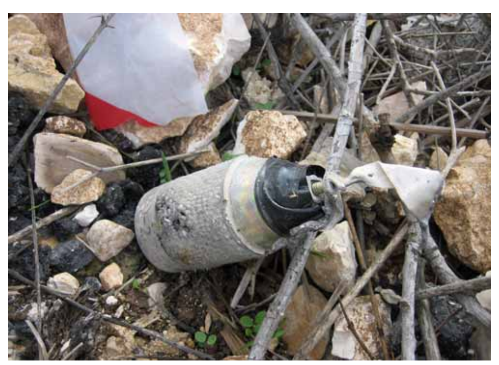
An unexploded MZD-2 submunition lies on the side of a road in Beit Yahoun, Lebanon, on October 24, 2006. Hezbollah launched these models into Israel, and this one is possibly from a Hezbollah cluster munition that never fired. The use of such Chinese-made weapons by a non-state armed group in the Middle East illustrates the dangers of proliferation of cluster munitions.