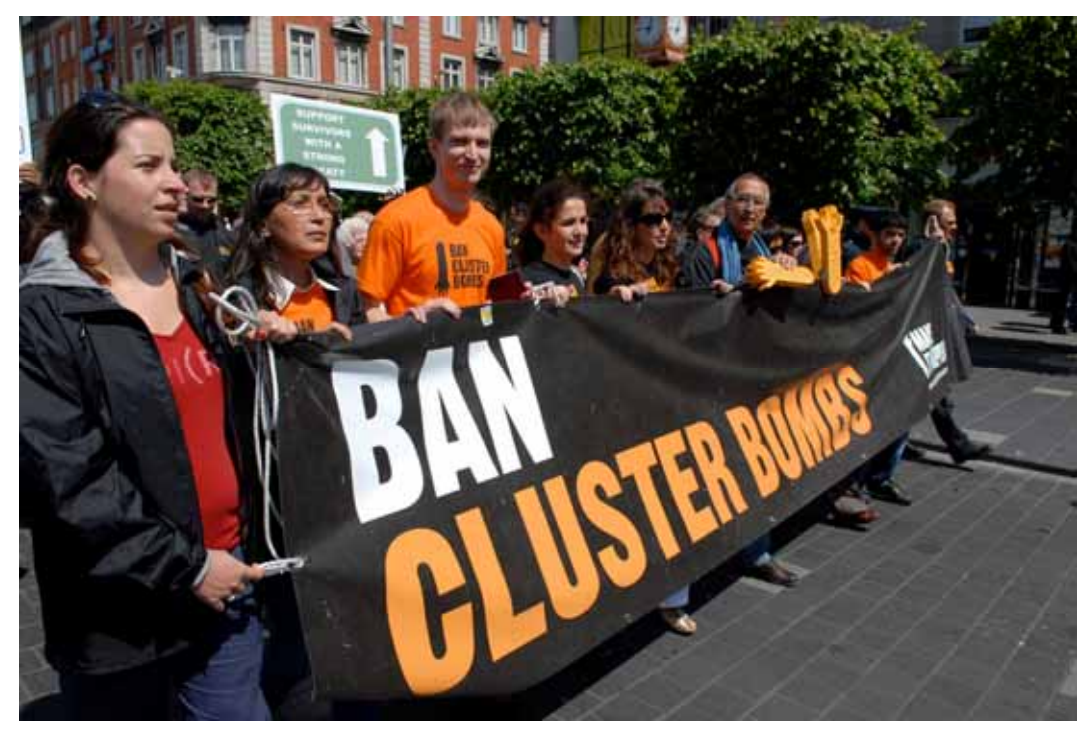
Campaigners from the Cluster Munition Coalition march to ban cluster munitions during the final negotiations of the Convention on Cluster Munitions in Dublin, Ireland, in May 2008.