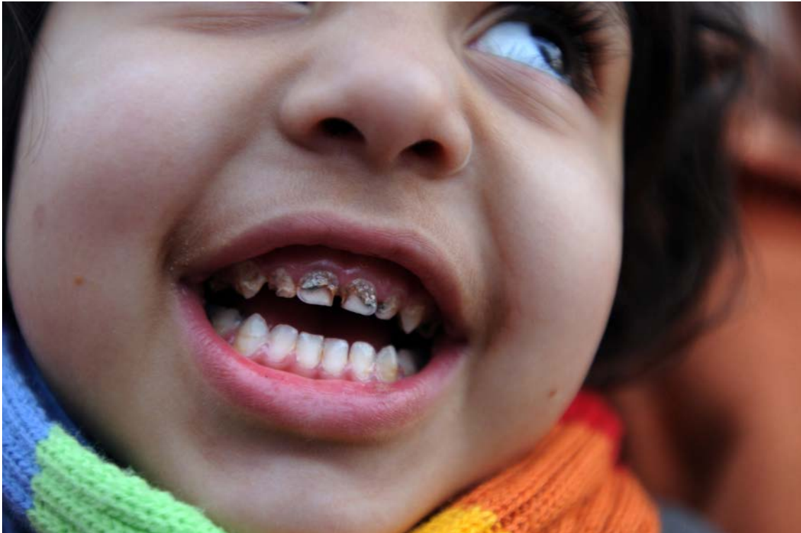
Child in Osterode with lead leaching out of their teeth.

UNMIK eventually transitioned oversight responsibility for the camps to the Kosovo government following Kosovo's declaration of independence in 2008. 103 Finally, Cesminluke/Česmin Lug closed in 2010, and Osterode in 2012. Leposaviq/Leposavić, the camp furthest from the Trepča mine, closed in 2013—14 years after the IDPs had moved in on a supposedly temporary basis. 104