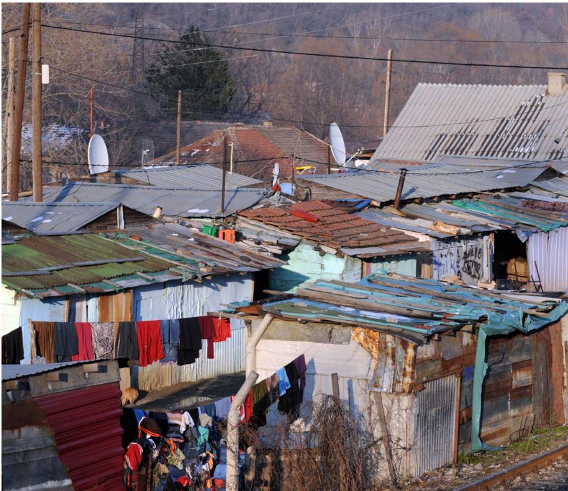
Camp conditions in Cesminluke/Česmin Lug.

Over the years, the toxic exposure resulted in extreme lead poisoning among many residents. Independent tests of residents' blood and hair revealed some of the highest lead levels ever recorded in humans. 70 Children were especially impacted. An assessment by the World Health Organization (WHO) and CDC in 2007 found that most, if not all, children living in Cesminluke/Česmin Lug and Zhikoc/Žitkovac had elevated blood levels at some point in their childhood, putting them at risk of lifetime developmental and behavioral disabilities and other health conditions. 71 Tests conducted on children between 2004-2008 consistently returned blood lead levels exceeding the highest level the machine could register. 72 Illnesses and disabilities consistent with lead poisoning are pervasive among the residents, and have resulted in several deaths. 73