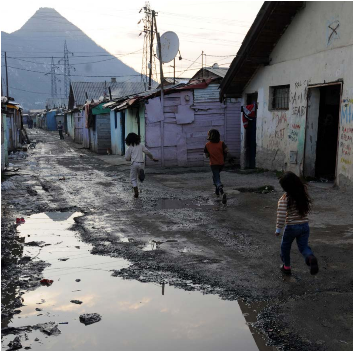
Children running through the camp at Cesminluke/Česmin Lug.

Since the closure of the last camp in 2013, human rights groups have documented persistent health issues among former camp residents that are associated with prolonged lead exposure, including seizures, memory loss, heart and kidney problems. 12 These conditions, and the weakened immune systems that often result from lead poisoning, now make the affected community especially vulnerable to COVID-19. 13 The need for effective remedies for the victims remains urgent.