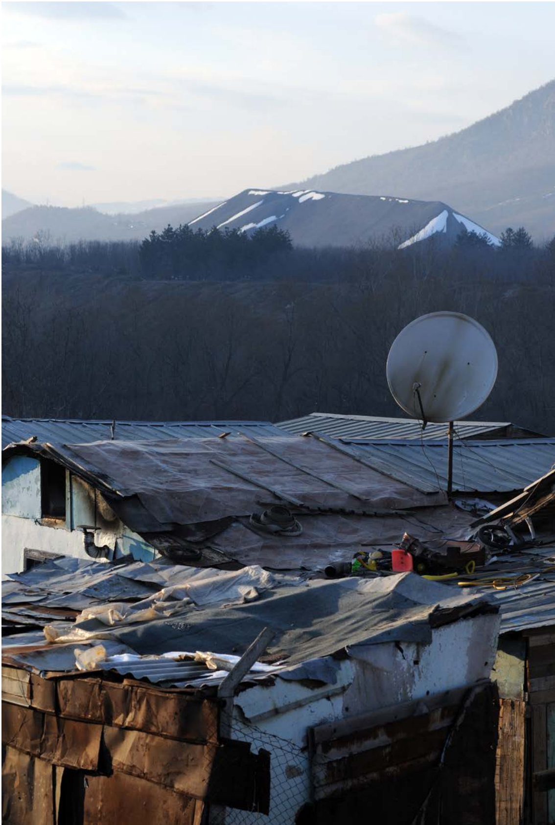
Cesminluke/Česmin Lug camp with the toxic Trepča slagheaps in the background.